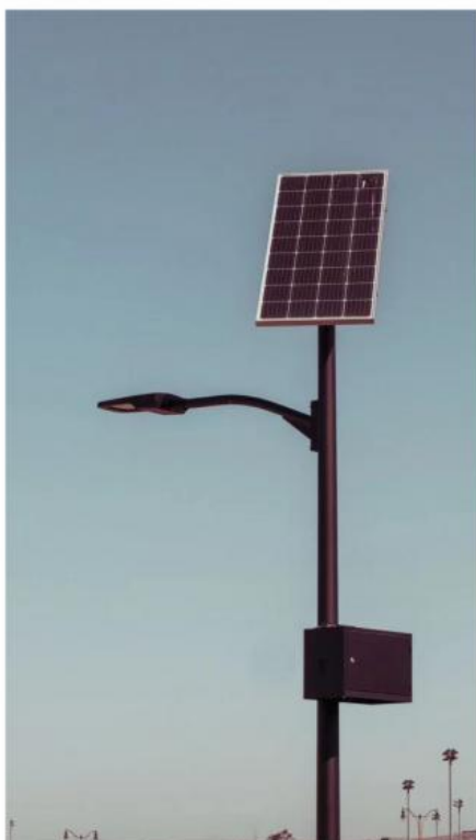
Solar street lamp