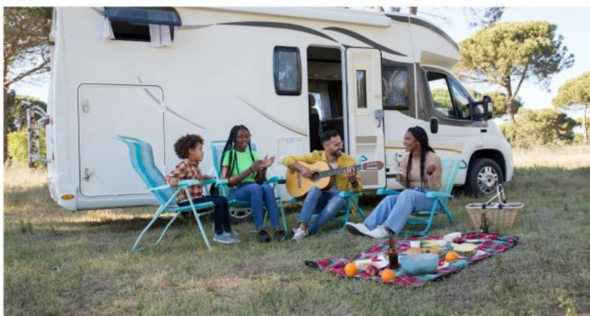
Backup power for outdoor camping